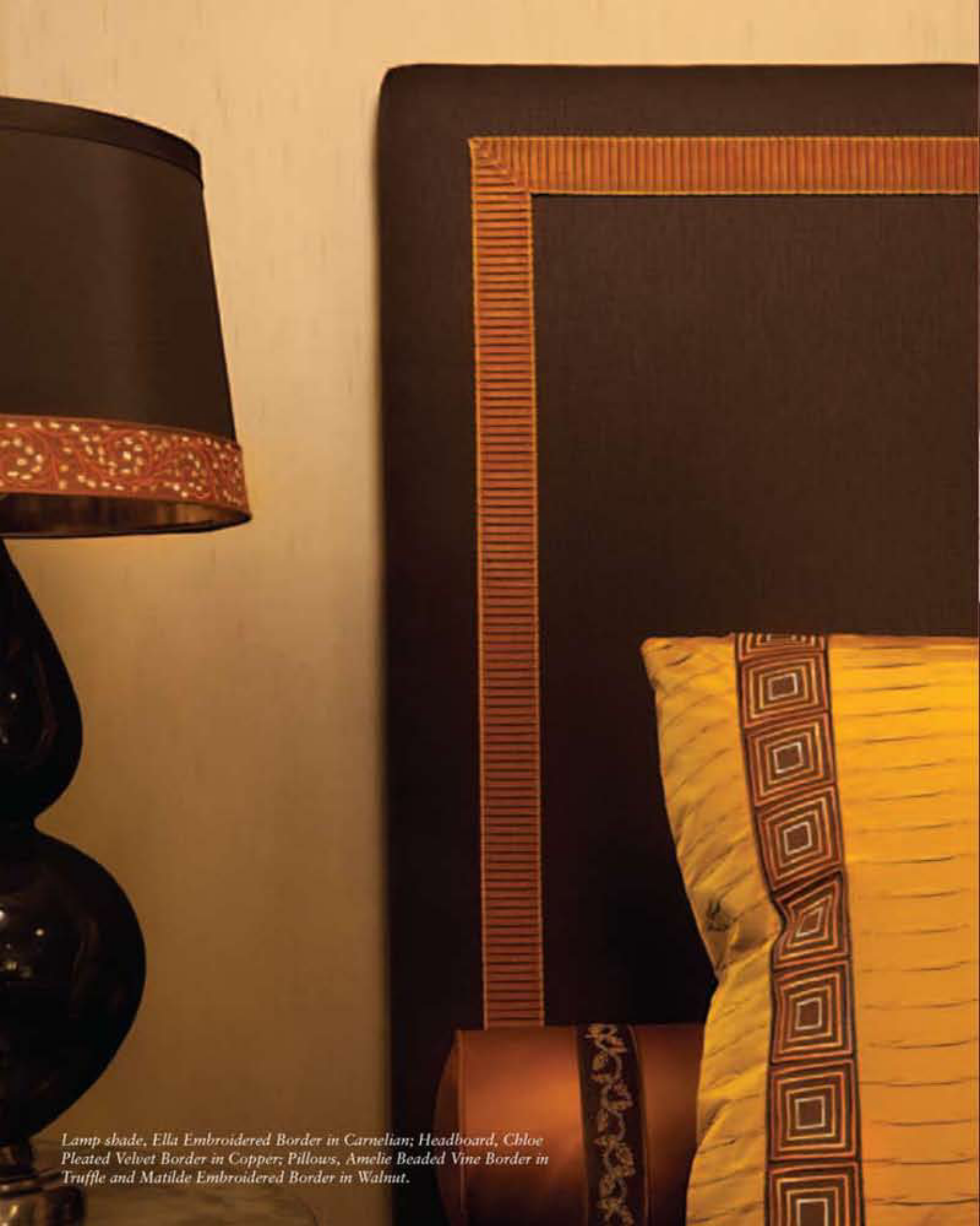
Lamp shade, Ella Embroidered Border in Carnelian; Headboard, Chloe Pleated Velvet Border in Copper; Pillows, Amelie Beaded Vine Border in Truffle and Matilde Embroidered Border in Walnut.