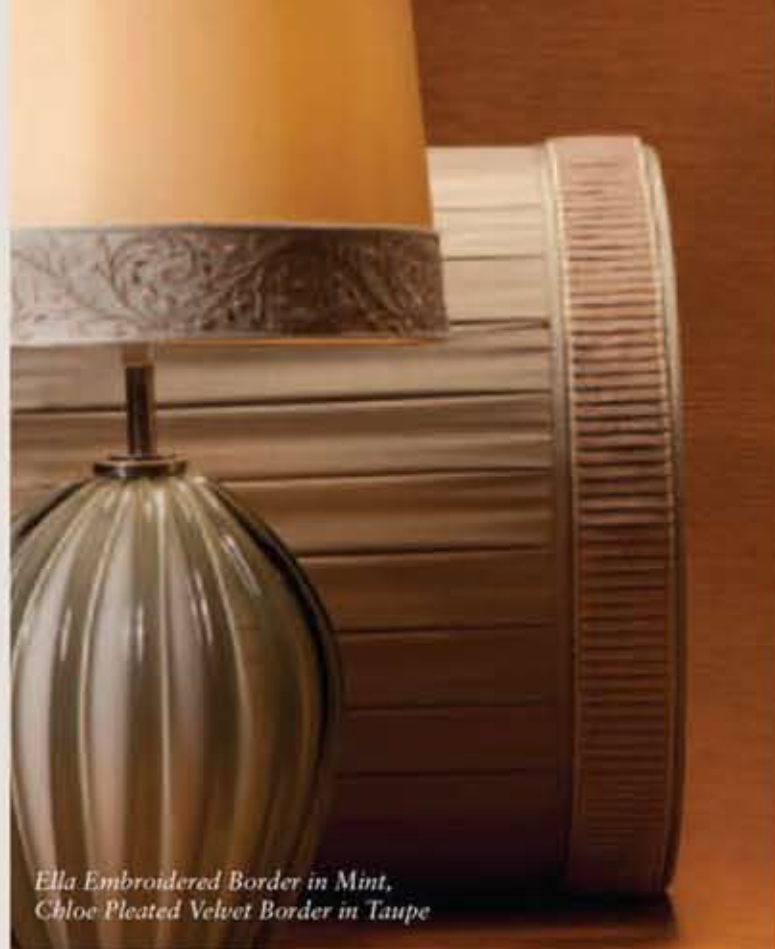
Ella Embroidered Border in Mint, Chloe Pleated Velvet Border in Taupe

Weitzner further transcends conventional embroidery by creating the more contemporary Amelie Beaded Vine Border, Matilda Embroidered Border and Natasha Striped Embroidered Border. The collection also includes the plush Chloe Pleated Velvet Border, and the solid Hannah Border. Each tape is available in a carefully selected range of elegant colorways.