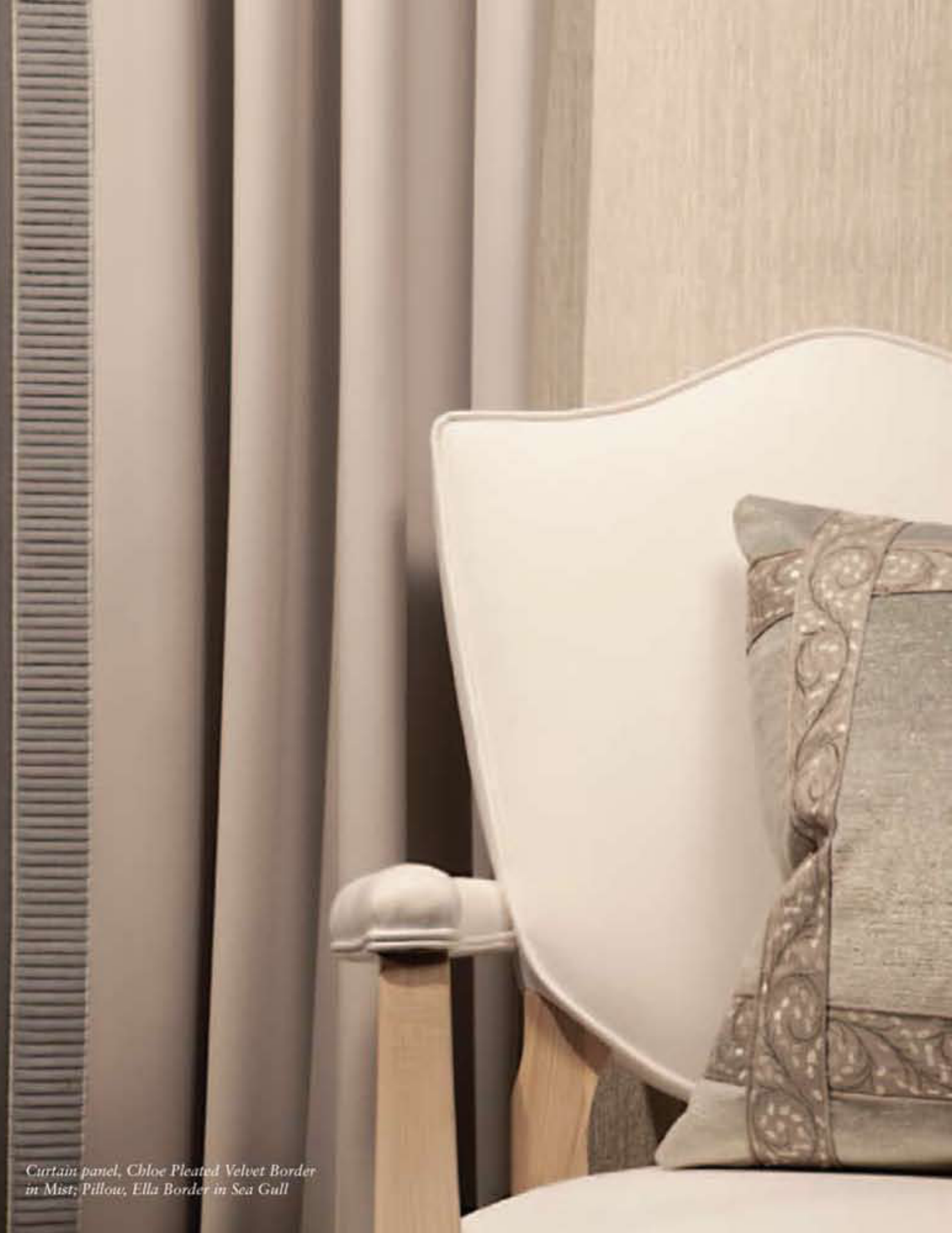
Curtain panel, Chloe Pleated Velvet Border in Mist; Pillow, Ella Border in Sea Gull