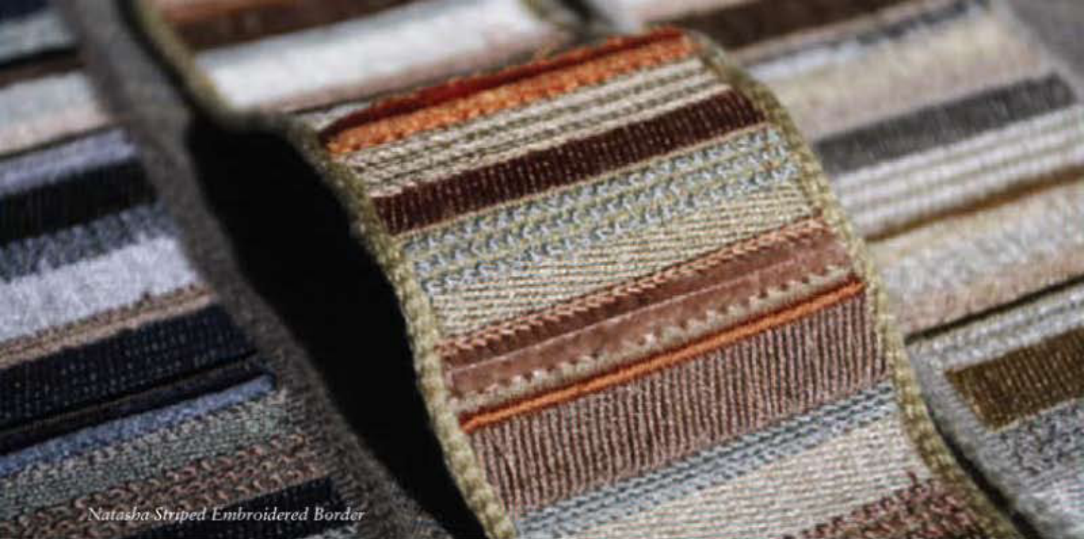
Natasha Striped Embroidered Border