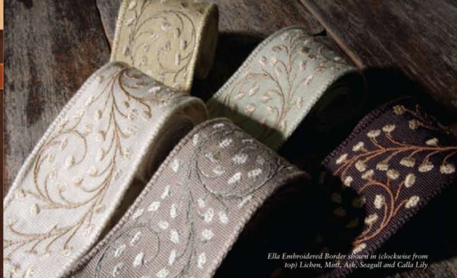
Ella Embroidered Border shown in (clockwise from top) Lichen, Mint, Ash, Seagull and Calla Lily

“Broderie enhances the personality of any fabric, like a perfectly placed accessory on a well-dressed woman. The borders compliment traditional settings, as well as more quiet and modern decor.”